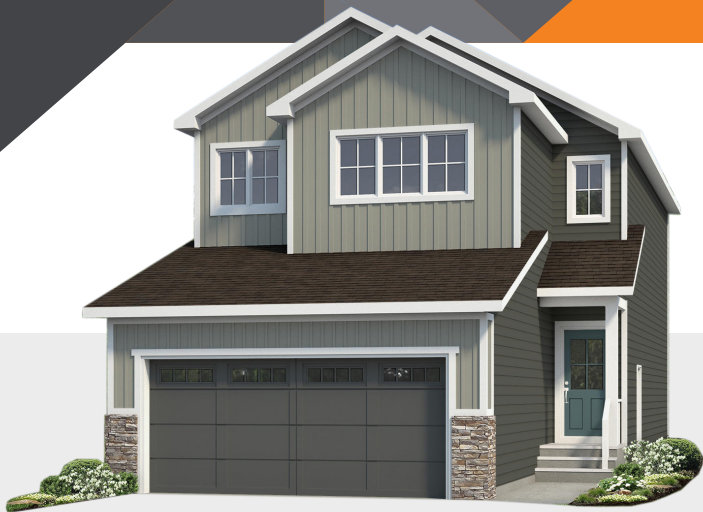
Shown in Modern Farmhouse elevation