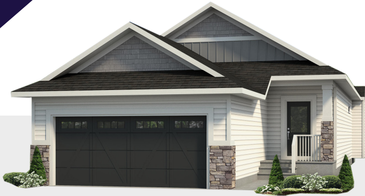
Shown in customized Prairie elevation