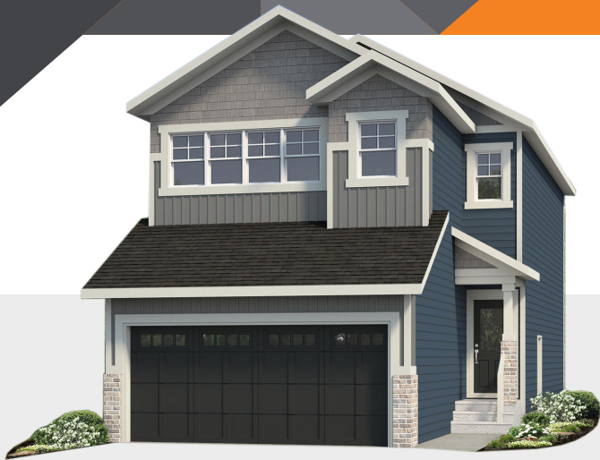
Shown in Craftsman elevation